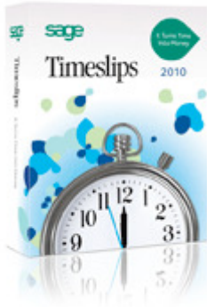
Timeslips Conversion to Abacus