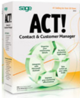
ACT! Conversion to Abacus